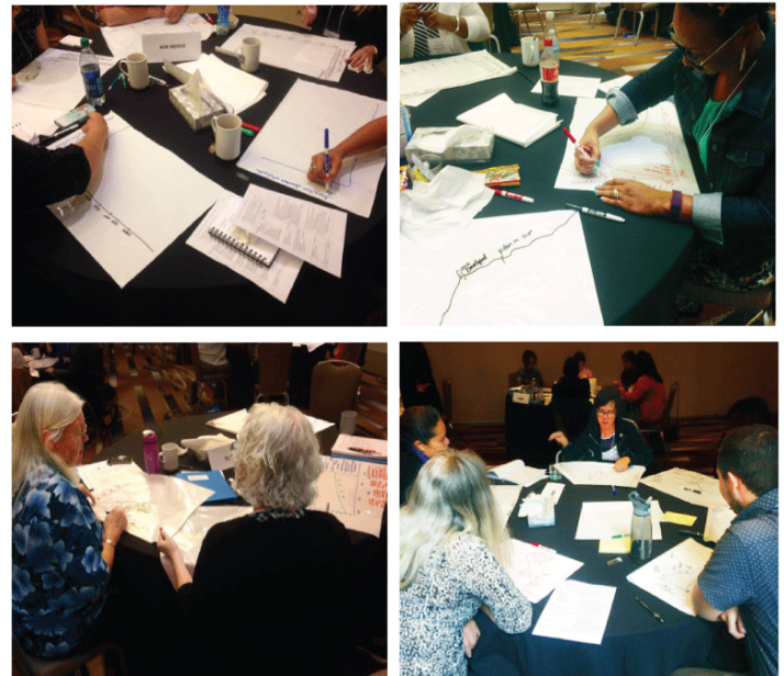
Figure 2. Photographs of maternal and child health practitioners and partners working on behavior over time graphs at the National Maternal and Child Health Workforce Development Center's 2016 Skills Institute.

promotion program over time. At another table, group members each thought about variables that reflected racism in their state, a challenge they agreed affected MCH outcomes in their target population, and annotated BOT graphs showing trends in racism over time. That particular group struggled with indicators that capture racism, a complex social construct, which led to interesting discussions within their team. While the team did not have time to definitively select indicators during the BOT session at the Skills Institute, they started the process of identifying root causes related to their MCH challenge and seeking indicators that reflect those key factors. An alternative approach to asking participants to select variables would have been to provide data about a variable over time and ask the group members to graph 1 or 2 factors that were contributing to the observed data trends, annotating key determinants of those factors (22). Insight can grow when the group integrates their individual graphs to develop a consensus graph that contains multiple variable trends graphed over the same period (10 minutes to discuss). This process requires participants to critique and integrate each other's understanding of determinants of the BOT graph. The BOT graph exercise encouraged individual and collective systems thinking to advance the teams' understanding of a complex MCH challenge.